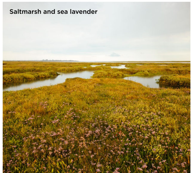
Saltmarsh and sea lavender

Measures to protect biodiversity and ecosystem services, including carbon storage, through conservation tools such as MPAs should be implemented. UK governments have championed key international agreements (such as the Convention on Biological Diversity's Global Biodiversity Framework) where protection of nature and its services are specified for national implementation. A shift to whole-site protection of MPAs (rather than the current feature-led approach), and the consideration of blue carbon in marine planning, would ensure that the natural carbon capture and storage processes are safeguarded and/or restored by managing damaging activities. At the same time, this would help to increase the resilience of the natural environment while contributing to meeting Net Zero targets.