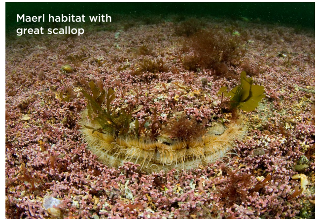
Maerl habitat with great scallop

● Additionally, biogenic reefs (e.g. horse mussel, blue mussel, native oyster, cold-water coral, tubeworm reefs, and maerl) are similar to surrounding sediments in their ability