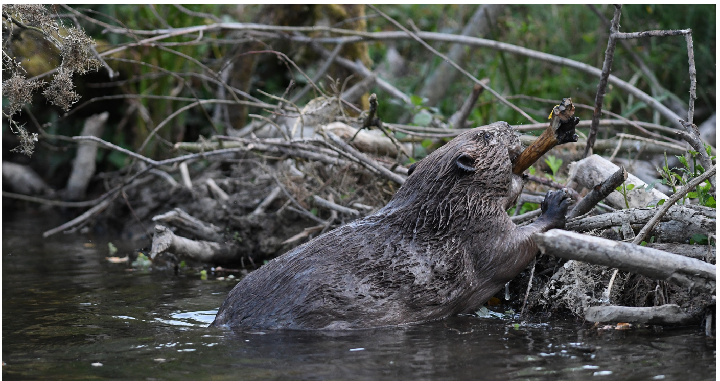
DAVID PARKYN / CORNWALL WILDLIFE TRUST